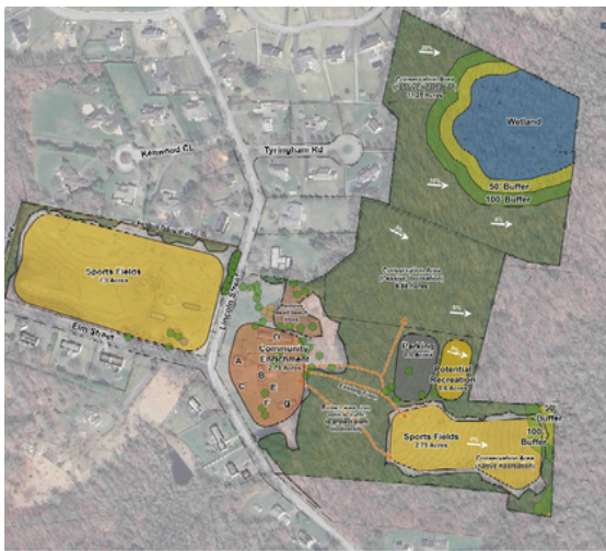
Seekonk - Medeiros Farm Recreation Complex Seekonk, MA

The Medeiros Farm Committee is nearing a major milestone in its efforts to transform the 40.12-acre property into a vibrant recreational, historical and educational hub. The town has retained CHA, Brewster Thornton, and Landscape Elements to craft a comprehensive recreational master plan, blending passive and active recreational features with historical preservation of the farm's existing buildings for future community use and learning.